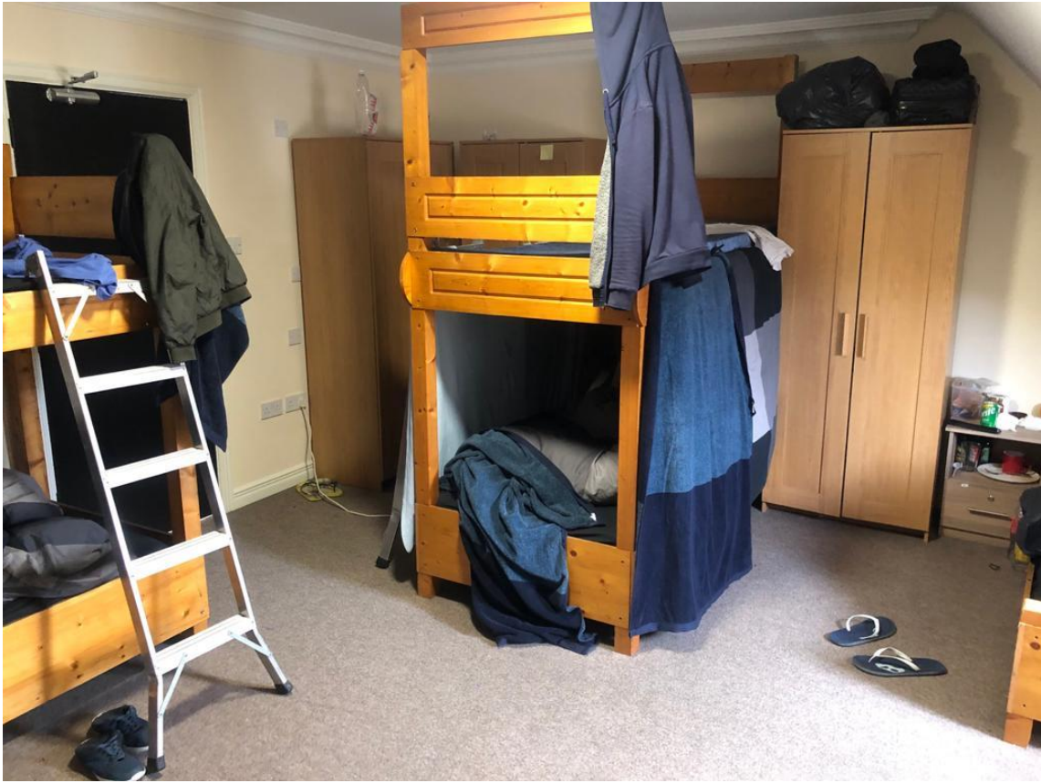
Bedroom for a family of 5 in Riverside Park Hotel in Macroom