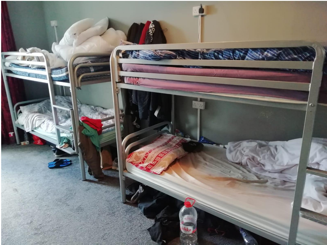
The Central Hostel in Miltown Malbay, Clare: tiny bedroom for 4 men.